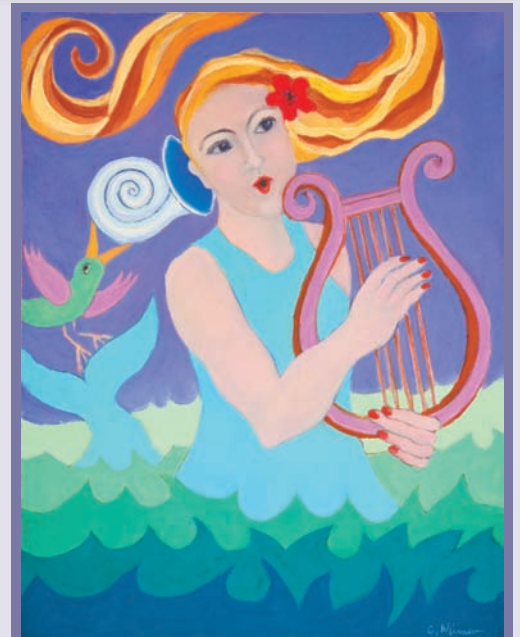
After an absence of two years, Viola has emerged from the sea off the shoreline of Amelia Island to herald the coming of the 2009 Amelia Island Chamber Music Festival

Festival Dates: May 21-May 24, May 31-June 14, October 27